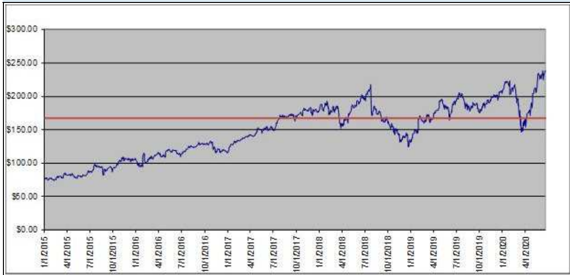
Class A Common Stock of Facebook, Inc. – Daily Closing Prices January 1, 2015 to June 19, 2020

*The red solid line indicates the downside threshold price of $167.153, which is 70% of the initial share price.