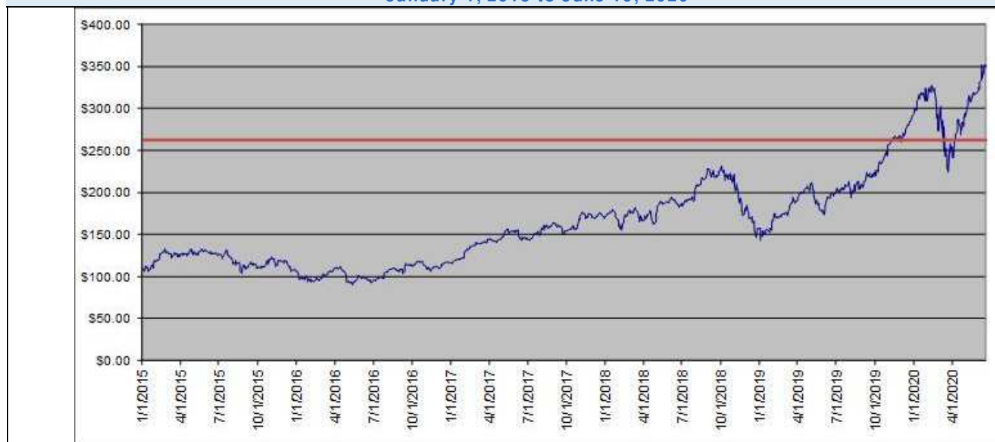
Common Stock of Apple Inc. – Daily Closing Prices January 1, 2015 to June 19, 2020

*The red solid line indicates the downside threshold price of $262.29, which is 75% of the initial share price.