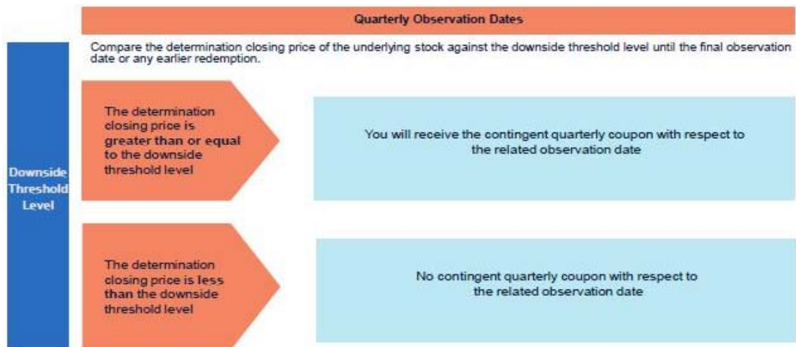
Diagram #2: Automatic Early Redemption (Beginning After Six Months)