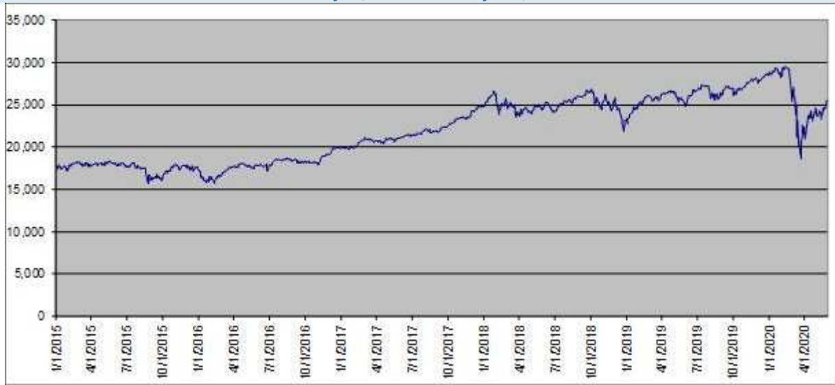
INDU Index Daily Closing Values January 1, 2015 to May 29, 2020

The following graph sets forth the daily closing values of the INDU Index for the period from January 1, 2015 through May 29, 2020. The related table sets forth the published high and low closing values, as well as end-of-quarter closing values, of the INDU index for each quarter in the same period. The closing value of the INDU Index on May 29, 2020 was 25,383.11. We obtained the information in the table below from Bloomberg Financial Markets, without independent verification. The INDU Index has at times experienced periods of high volatility, and you should not take the historical values of the INDU Index as an indication of its future performance.