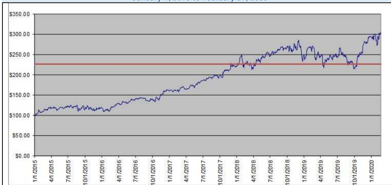
Common Stock of UnitedHealth Group Incorporated – Daily Closing Prices January 1, 2015 to February 21, 2020

*The red solid line indicates the downside threshold price of $226.073, which is approximately 75% of the initial share price.