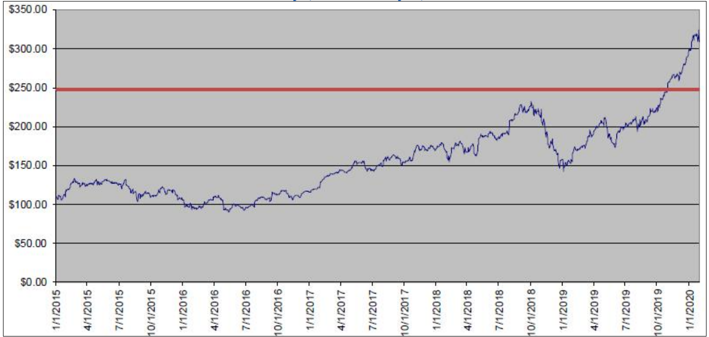
Common Stock of Apple Inc. – Daily Closing Prices January 1, 2015 to January 31, 2020

*The red solid line indicates the downside threshold price of $247.608, which is 80% of the initial share price.