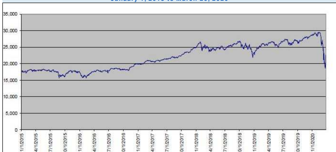
INDU Index Daily Closing Values January 1, 2015 to March 26, 2020