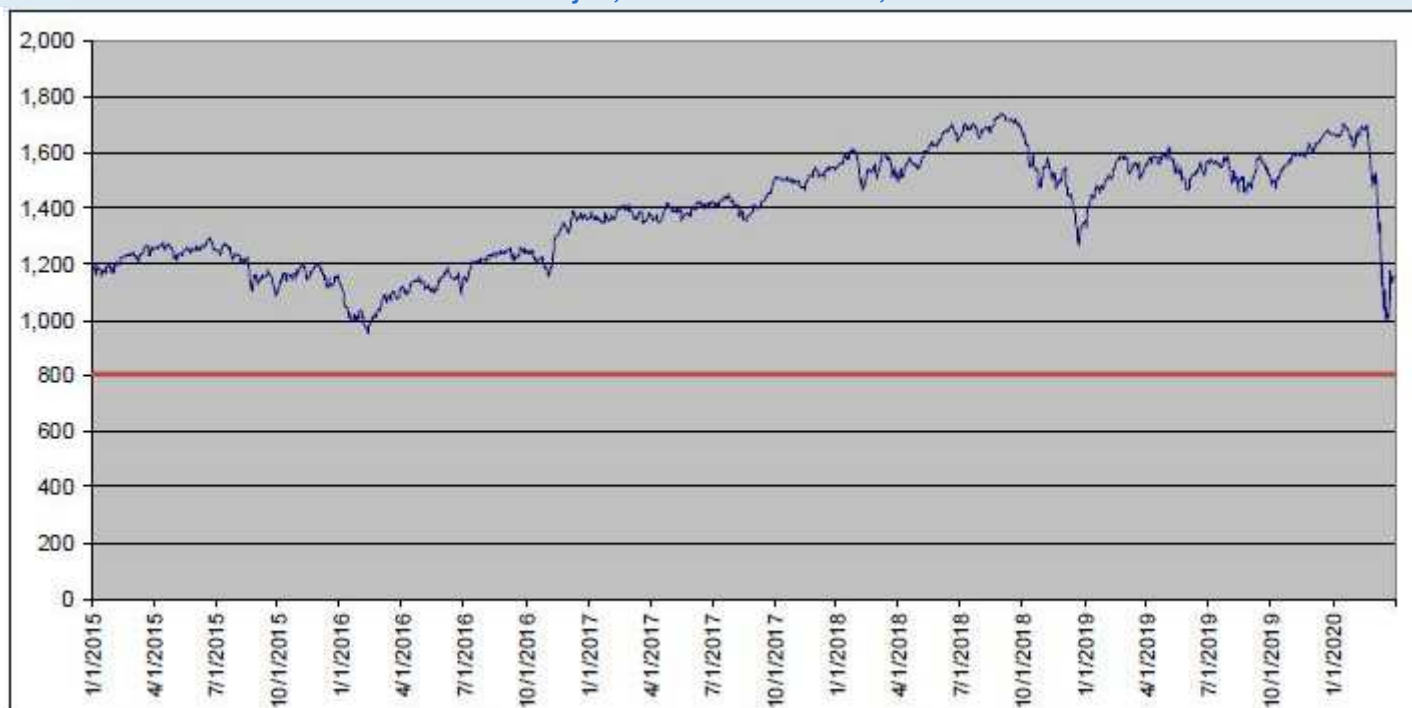
RTY Index Daily Closing Values January 1, 2015 to March 31, 2020

* The red line in the graph indicates both the downside threshold level and the coupon threshold level of 807.172, each of which is approximately 70% of the initial index value.