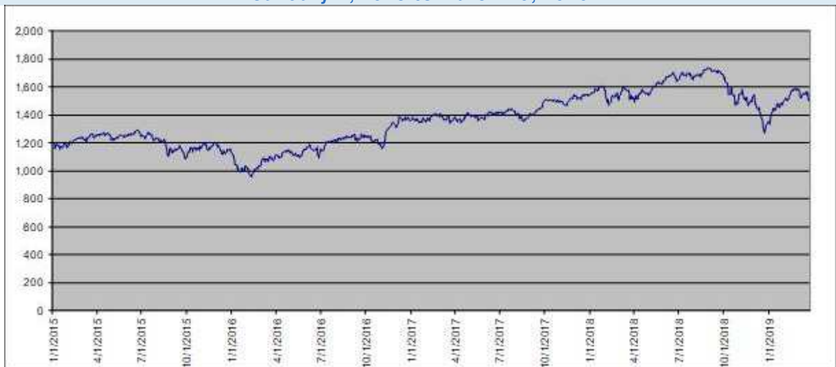
RTY Index Daily Closing Values January 1, 2015 to March 26, 2020

The following graph sets forth the daily closing values of the RTY Index for the period from January 1, 2015 through March 26, 2020. The related table sets forth the published high and low closing values, as well as end-of-quarter closing values, of the RTY index for each quarter in the same period. The closing value of the RTY Index on March 26, 2020 was 1,180.319. We obtained the information in the table below from Bloomberg Financial Markets, without independent verification. The RTY Index has at times experienced periods of high volatility, and you should not take the historical values of the RTY Index as an indication of its future performance.