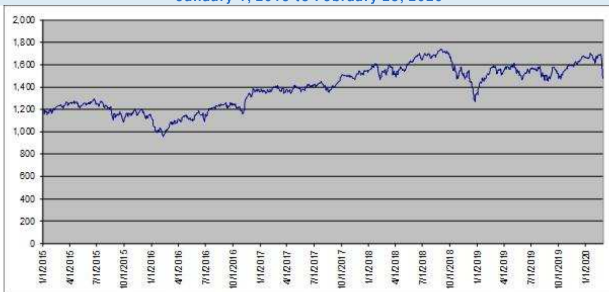
RTY Index Daily Closing Values January 1, 2015 to February 28, 2020

The following graph sets forth the daily closing values of the RTY Index for the period from January 1, 2015 through February 28, 2020. The related table sets forth the published high and low closing values, as well as end-of-quarter closing values, of the RTY index for each quarter in the same period. The closing value of the RTY Index on February 28, 2020 was 1,476.431. We obtained the information in the table below from Bloomberg Financial Markets, without independent verification. The RTY Index has at times experienced periods of high volatility, and you should not take the historical values of the RTY Index as an indication of its future performance.