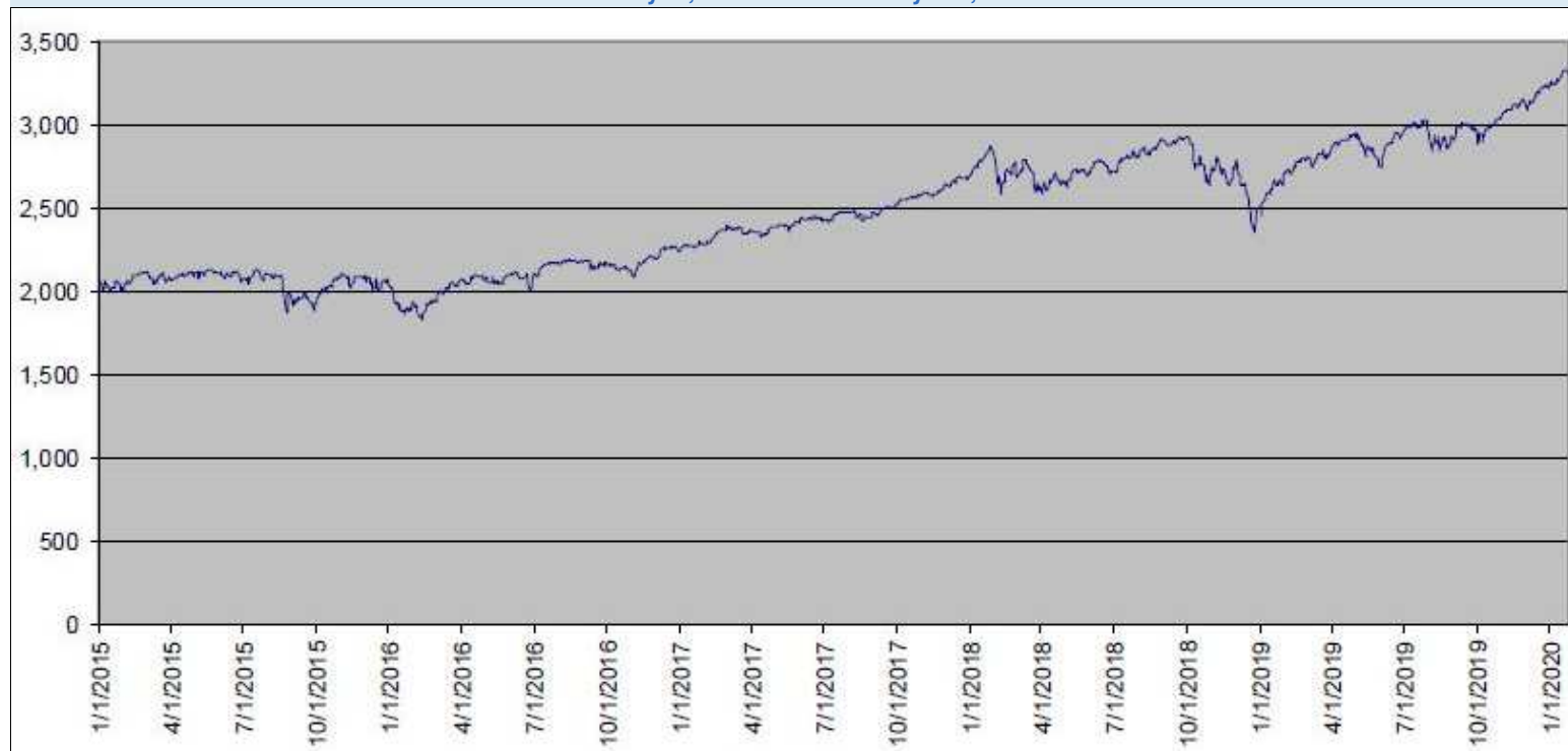
S&P 500 ® Index Daily Index Closing Values January 1, 2015 to January 24, 2020

The following graph sets forth the daily index closing values of the underlying index for each quarter in the period from January 1, 2015 through January 24, 2020. The related table sets forth the published high and low closing values, as well as end-of-quarter closing values, of the underlying index for each quarter in the same period. The index closing value of the underlying index on January 24, 2020 was 3,295.47. We obtained the information in the table and graph below from Bloomberg Financial Markets, without independent verification. The underlying index has at times experienced periods of high volatility. You should not take the historical values of the underlying index as an indication of its future performance, and no assurance can be given as to the index closing value of the underlying index on the valuation date.