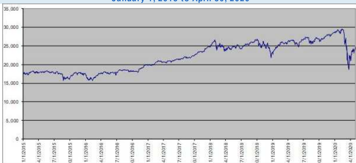
INDU Index Daily Closing Values January 1, 2015 to April 30, 2020

The following graph sets forth the daily closing values of the INDU Index for the period from January 1, 2015 through April 30, 2020. The related table sets forth the published high and low closing values, as well as end-of-quarter closing values, of the INDU Index for each quarter in the same period. The closing value of the INDU Index on April 30, 2020 was 24,345.72. We obtained the information in the table below from Bloomberg Financial Markets, without independent verification. The INDU Index has at times experienced periods of high volatility, and you should not take the historical values of the INDU Index as an indication of its future performance.