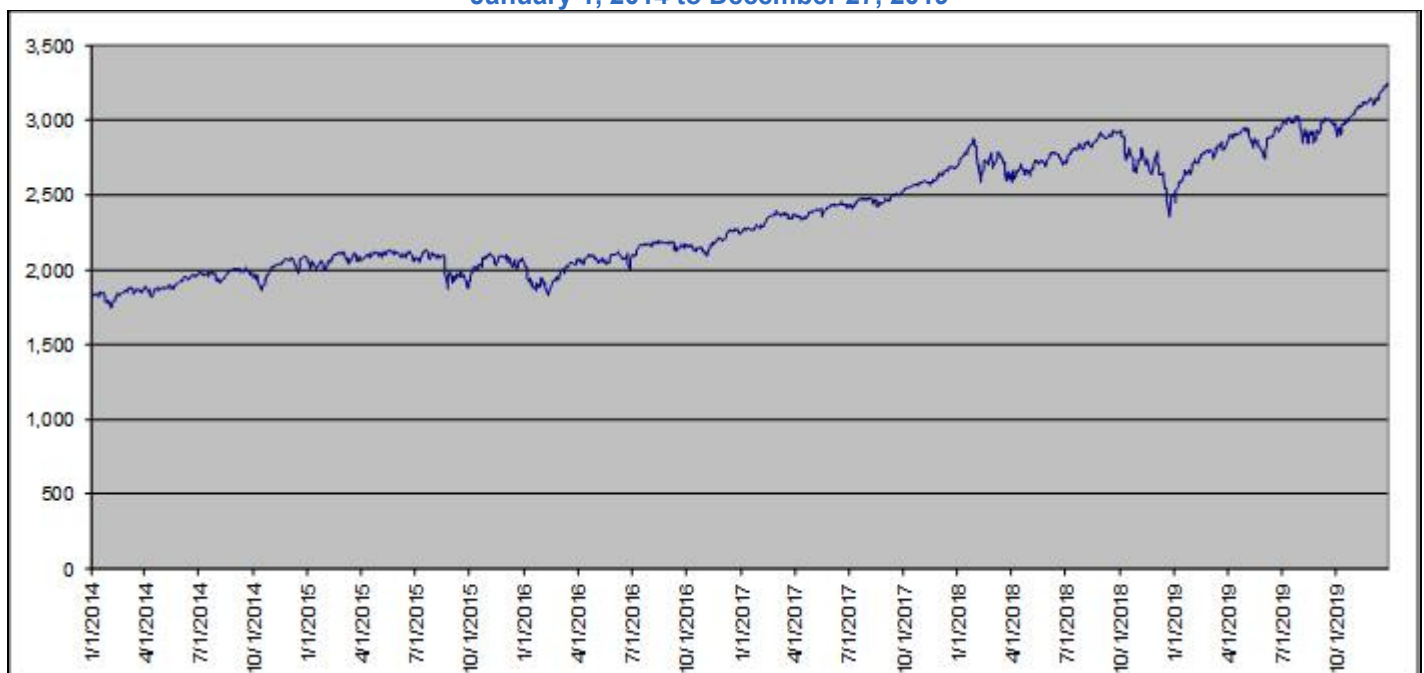
S&P 500 ® Index Daily Closing Values January 1, 2014 to December 27, 2019

The following graph sets forth the daily index closing values of the underlying index for each quarter in the period from January 1, 2014 through December 27, 2019. The related table sets forth the published high and low closing values, as well as end-of-quarter closing values, of the underlying index for each quarter in the same period. The index closing value of the underlying index on December 27, 2019 was 3,240.02. We obtained the information in the table and graph below from Bloomberg Financial Markets, without independent verification. The underlying index has at times experienced periods of high volatility. You should not take the historical values of the underlying index as an indication of its future performance, and no assurance can be given as to the index closing value of the underlying index on the valuation date.