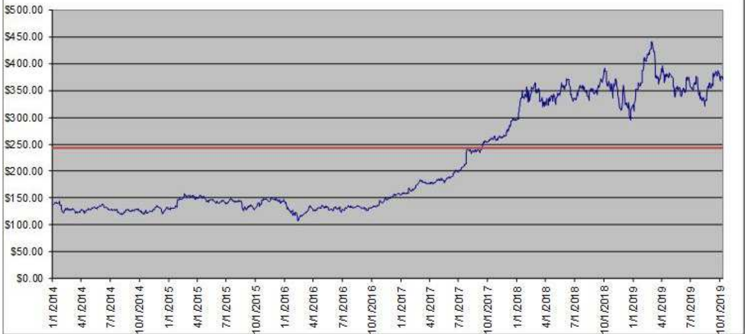
Common Stock of The Boeing Company – Daily Closing Prices January 1, 2014 to October 11, 2019

*The red solid line indicates the downside threshold price of $243.698, which is 65% of the initial share price.