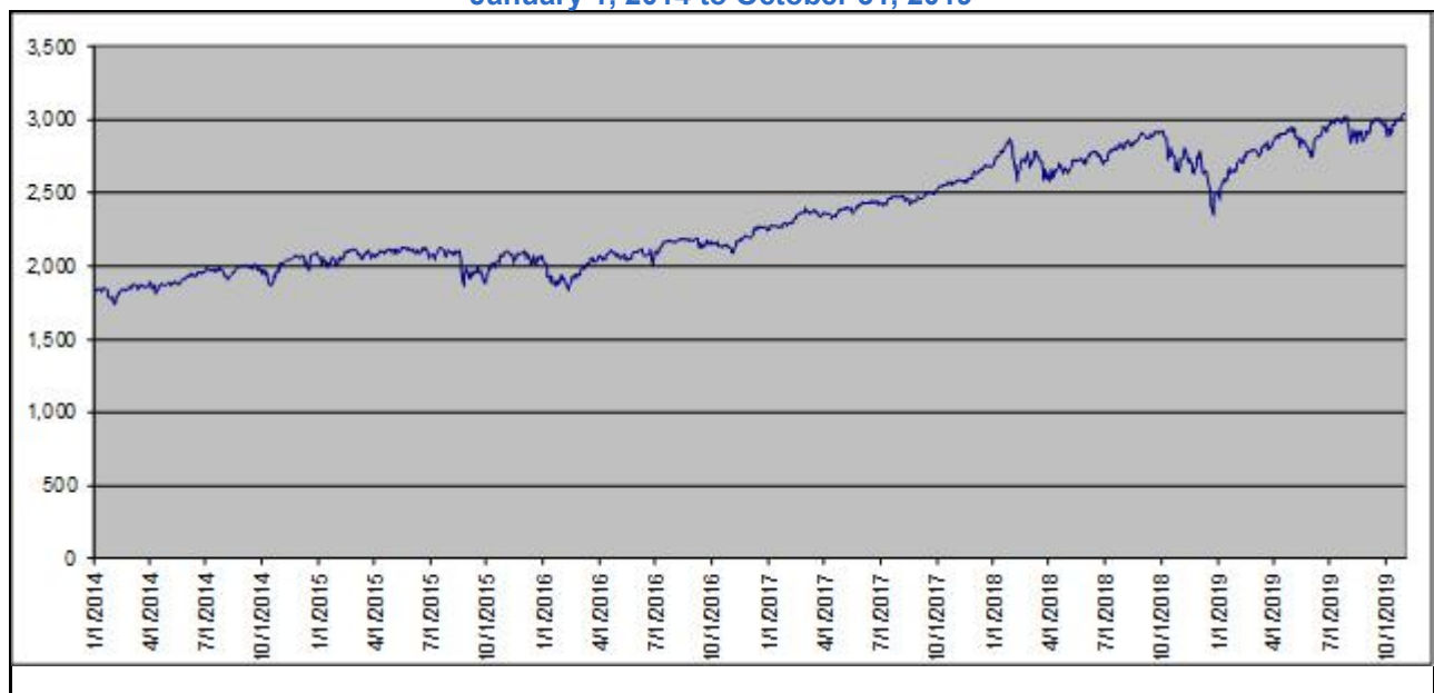
S&P 500 ® Index Daily Index Closing Values January 1, 2014 to October 31, 2019

The following graph sets forth the daily index closing values of the underlying index for each quarter in the period from January 1, 2014 through October 31, 2019. The related table sets forth the published high and low closing values, as well as end-of-quarter closing values, of the underlying index for each quarter in the same period. The index closing value of the underlying index on October 31, 2019 was 3,037.56. We obtained the information in the table and graph below from Bloomberg Financial Markets, without independent verification. The underlying index has at times experienced periods of high volatility. You should not take the historical values of the underlying index as an indication of its future performance, and no assurance can be given as to the index closing value of the underlying index on the valuation date.