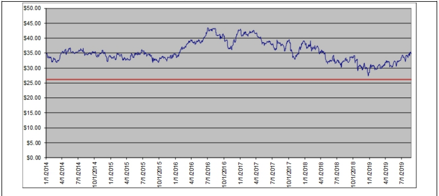
Common Stock of AT&T Inc. – Daily Closing Prices January 1, 2014 to August 23, 2019

*The red solid line indicates the downside threshold price of $26.115, which is 75% of the initial share price.