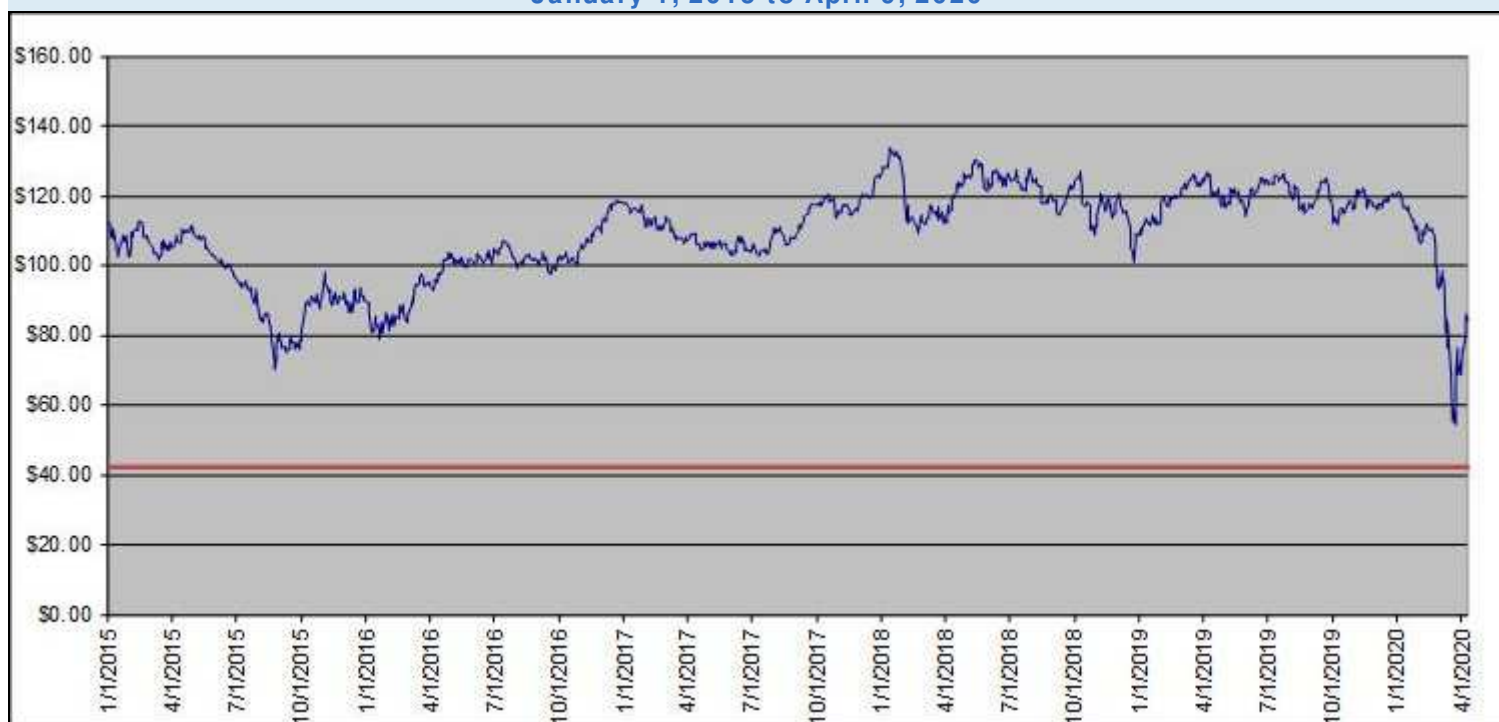
Common Stock of Chevron Corporation – Daily Closing Prices January 1, 2015 to April 9, 2020

*The red solid line indicates the downside threshold price of $42.155, which is 50% of the initial share price.