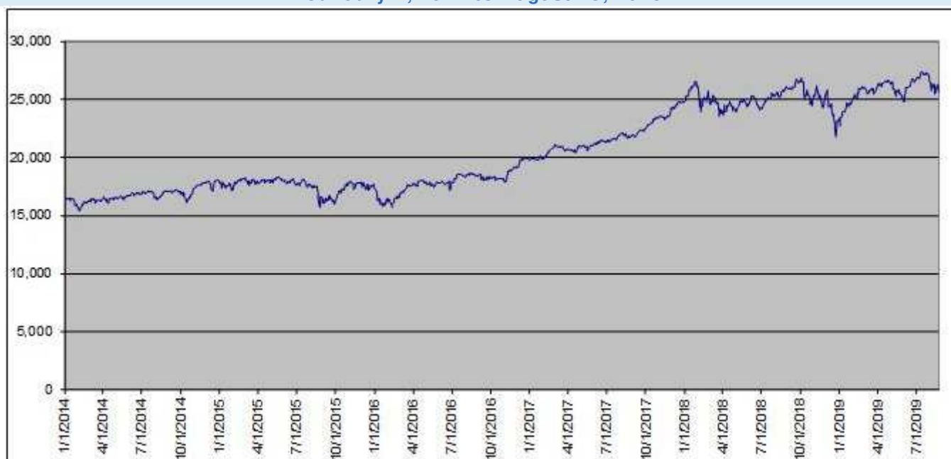
Dow Jones Industrial Average SM Daily Index Closing Values January 1, 2014 to August 23, 2019

The following graph sets forth the daily index closing values of the underlying index for each quarter in the period from January 1, 2014 through August 23, 2019. The related table sets forth the published high and low closing values, as well as end-of-quarter closing values, of the underlying index for each quarter in the same period. The index closing value of the underlying index on August 23, 2019 was 25,628.90. We obtained the information in the table and graph below from Bloomberg Financial Markets, without independent verification. The underlying index has at times experienced periods of high volatility. You should not take the historical values of the underlying index as an indication of its future performance, and no assurance can be given as to the index closing value of the underlying index on the valuation date.