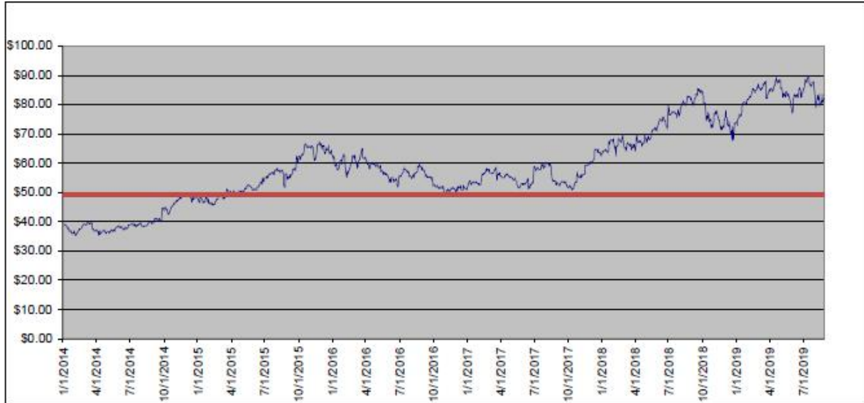
Common Stock of NIKE, Inc. – Daily Closing Prices January 1, 2014 to August 27, 2019

* The red solid line indicates the downside threshold level of $49.218, which is 60% of the initial share price.