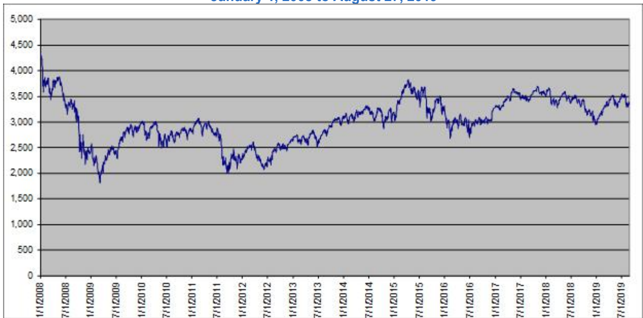
EURO STOXX 50® Index Historical Performance Daily Closing Values January 1, 2008 to August 27, 2019

The following graph sets forth the daily closing values of the underlying index for the period from January 1, 2008 through August 27, 2019. The related table sets forth the published high and low closing values, as well as end-of-quarter closing values, of the underlying index for each quarter in the same period. The closing value of the underlying index on August 27, 2019 was 3,370.47. We obtained the information in the table and graph below from Bloomberg Financial Markets, without independent verification. The underlying index has at times experienced periods of high volatility, and you should not take the historical values of the underlying index as an indication of its future performance.