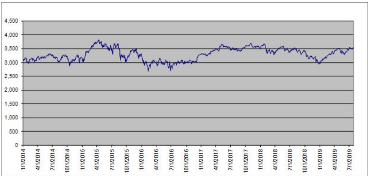
EURO STOXX 50® Index Historical Performance Daily Closing Values January 1, 2008 to July 26, 2019

The following graph sets forth the daily closing values of the underlying index for the period from January 1, 2008 through July 26, 2019. The related table sets forth the published high and low closing values, as well as end-of-quarter closing values, of the underlying index for each quarter in the same period. The closing value of the underlying index on July 26, 2019 was 3,524.47. We obtained the information in the table and graph below from Bloomberg Financial Markets, without independent verification. The underlying index has at times experienced periods of high volatility, and you should not take the historical values of the underlying index as an indication of its future performance.