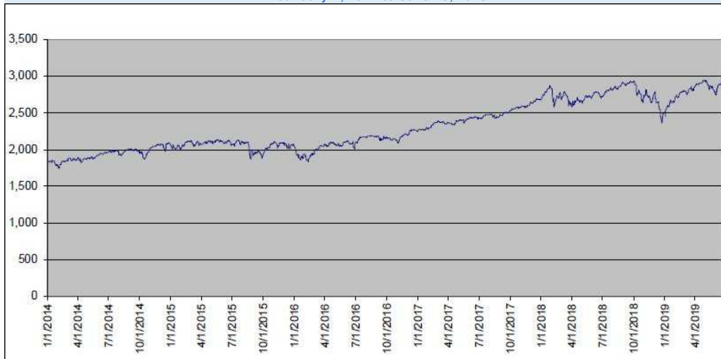
S&P 500 ® Index Daily Index Closing Values January 1, 2014 to June 25, 2019

The following graph sets forth the daily index closing values of the underlying index for each quarter in the period from January 1, 2014 through June 25, 2019. The related table sets forth the published high and low closing values, as well as end-of-quarter closing values, of the underlying index for each quarter in the same period. The index closing value of the underlying index on June 25, 2019 was 2,917.38. We obtained the information in the table and graph below from Bloomberg Financial Markets, without independent verification. The underlying index has at times experienced periods of high volatility. You should not take the historical values of the underlying index as an indication of its future performance, and no assurance can be given as to the index closing value of the underlying index on the valuation date.