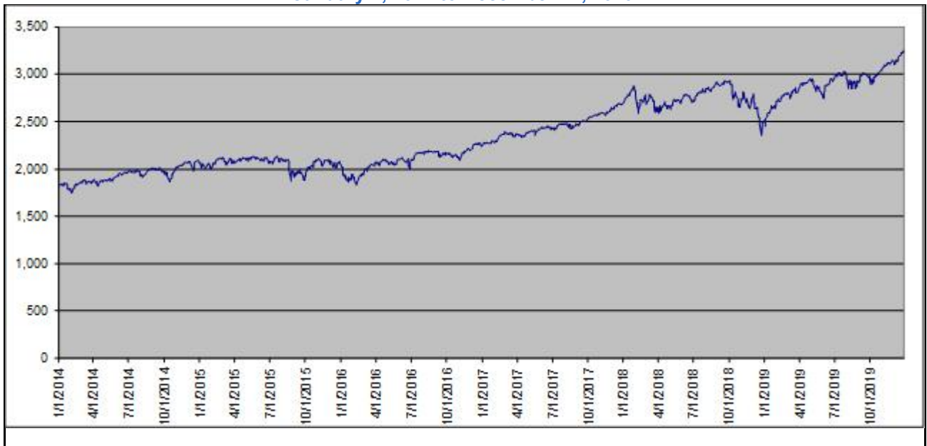
S&P 500® Index Daily Index Closing Values January 1, 2014 to December 27, 2019

The following graph sets forth the daily index closing values of the underlying index for each quarter in the period from January 1, 2014 through December 27, 2019. The related table sets forth the published high and low closing values, as well as end-of-quarter closing values, of the underlying index for each quarter in the same period. The index closing value of the underlying index on December 27, 2019 was 3,240.02. We obtained the information in the table and graph below from Bloomberg Financial Markets, without independent verification. The underlying index has at times experienced periods of high volatility. You should not take the historical values of the underlying index as an indication of its future performance, and no assurance can be given as to the index closing value of the underlying index on the valuation date.