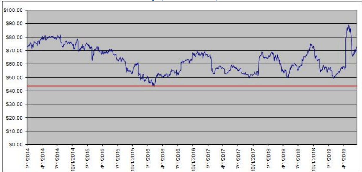
Common Stock of QUALCOMM Incorporated – Daily Closing Prices January 1, 2014 to June 21, 2019

*The red solid line indicates the downside threshold price of $43.632, which is 60% of the initial share price.