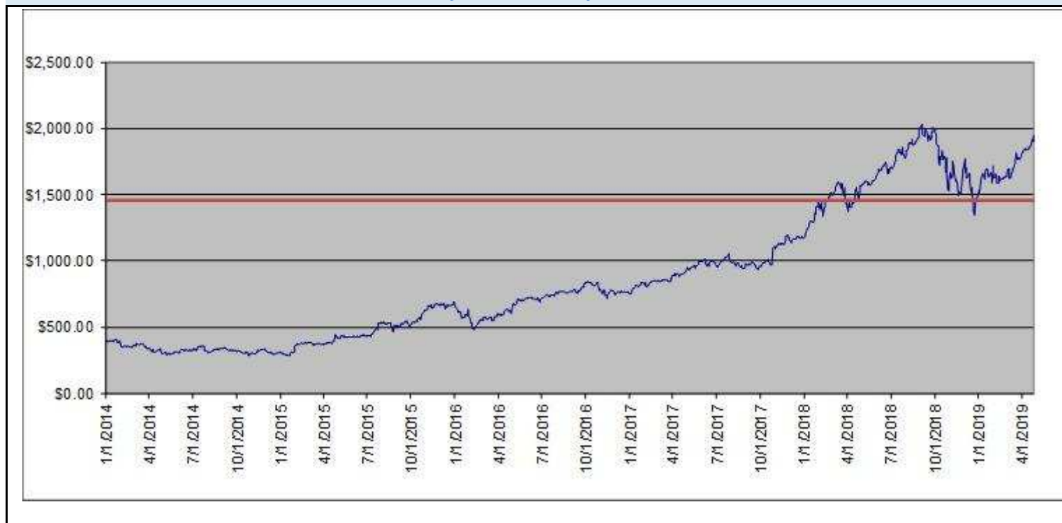
Common Stock of Amazon.com, Inc. – Daily Closing Prices January 1, 2014 to April 26, 2019

*The red solid line indicates the downside threshold price of $1,462.973, which is approximately 75% of the initial share price.