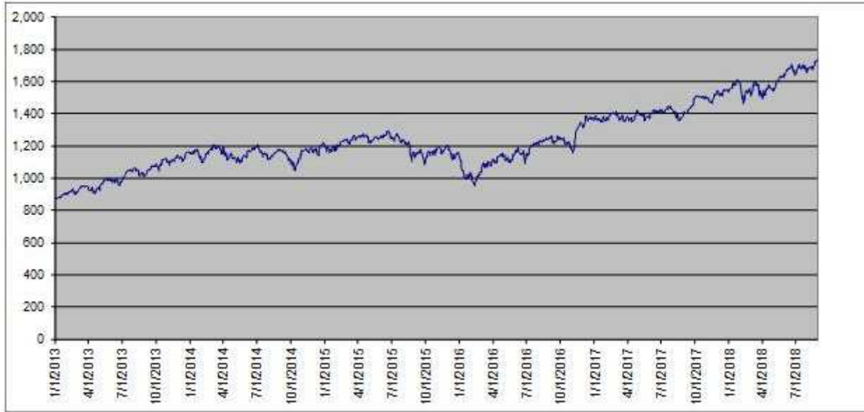
RTY Index Daily Closing Values January 1, 2013 to August 28, 2018