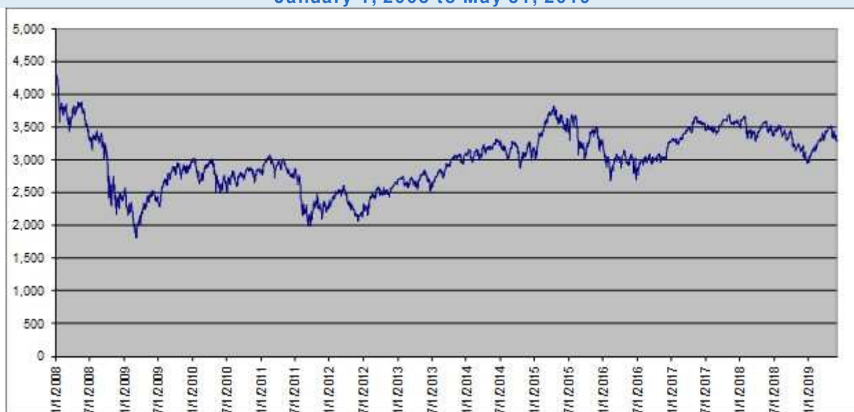
EURO STOXX 50® Index Historical Performance Daily Closing Values January 1, 2008 to May 31, 2019

The following graph sets forth the daily closing values of the underlying index for the period from January 1, 2008 through May 31, 2019. The related table sets forth the published high and low closing values, as well as end-of-quarter closing values, of the underlying index for each quarter in the same period. The closing value of the underlying index on May 31, 2019 was 3,280.43. We obtained the information in the table and graph below from Bloomberg Financial Markets, without independent verification. The underlying index has at times experienced periods of high volatility, and you should not take the historical values of the underlying index as an indication of its future performance.