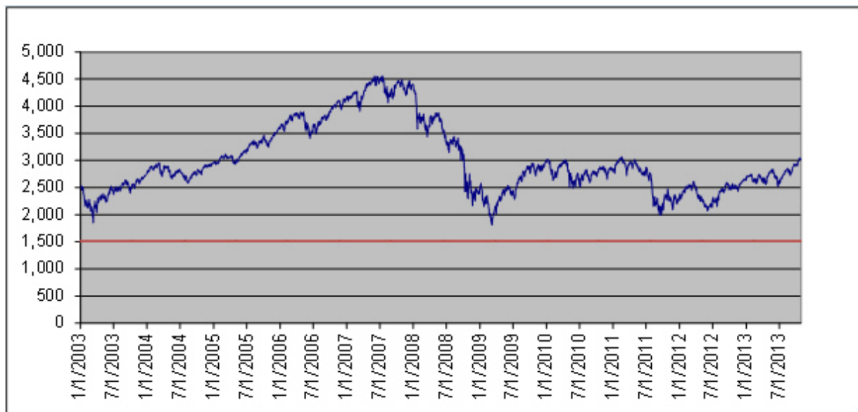
SX5E Index Historical Performance Daily Closing Values January 1, 2003 to October 28, 2013

* The red solid line in the graph indicates the barrier level of 1,511.02, which is 50% of the initial index value.