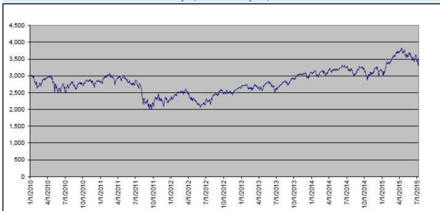
Underlying Index Historical Performance – Daily Index Closing Values January 1, 2010 to July 10, 2015

The following graph sets forth the daily closing values of the underlying index for the period from January 1, 2010 through July 10, 2015. The related table sets forth the published high and low closing values, as well as end-of-quarter closing values, of the underlying index for each quarter in the same period. The closing value of the underlying index on July 10, 2015 was 3,528.81. We obtained the information in the table and graph below from Bloomberg Financial Markets, without independent verification. The underlying index has at times experienced periods of high volatility, and you should not take the historical values of the underlying index as an indication of its future performance.