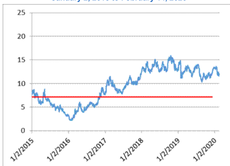
Vale S.A. ADSs Daily Closing Levels January 2, 2015 to February 14, 2020

* The solid red line in the graph indicates the Coupon Barrier Level and Downside Threshold Level.