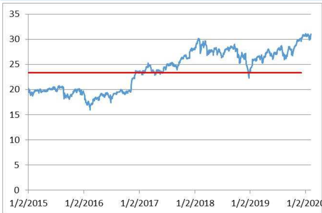
Financial Select Sector SPDR® Fund Daily Closing Levels January 2, 2015 to February 5, 2020

* The solid red line in the graph indicates the Downside Threshold Level and the Coupon Barrier Level.