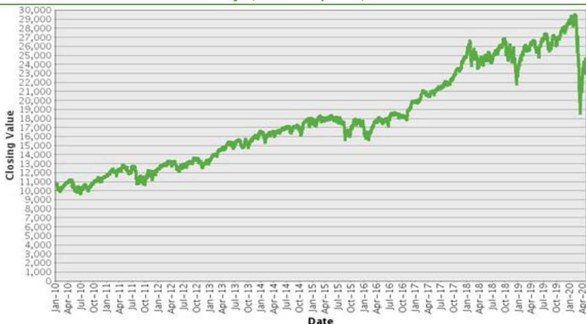
Dow Jones Industrial Average™ – Historical Closing Values January 4, 2010 to April 30, 2020

The graph below shows the closing value of the Dow Jones Industrial Average™ for each day such value was available from January 4, 2010 to April 30, 2020. We obtained the closing values from Bloomberg L.P., without independent verification. You should not take historical closing values as an indication of future performance.