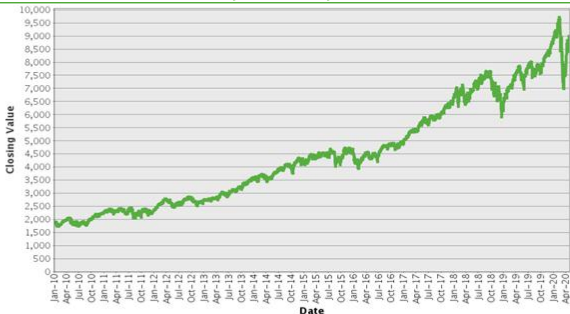
Nasdaq-100 Index ® – Historical Closing Values January 4, 2010 to May 1, 2020

The graph below shows the closing value of the Nasdaq-100 Index ® for each day such value was available from January 4, 2010 to May 1, 2020. We obtained the closing values from Bloomberg L.P., without independent verification. You should not take historical closing values as an indication of future performance.