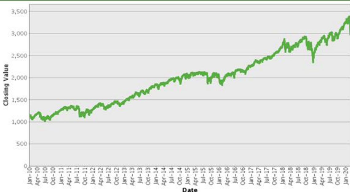
S&P 500 ® Index – Historical Closing Values January 4, 2010 to February 27, 2020

The graph below shows the closing value of the S&P 500 ® Index for each day such value was available from January 4, 2010 to February 27, 2020. We obtained the closing values from Bloomberg L.P., without independent verification. You should not take historical closing values as an indication of future performance.