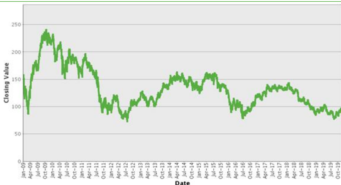
EURO STOXX ® Banks Index – Historical Closing Values January 2, 2009 to November 20, 2019

The graph below shows the closing value of the EURO STOXX ® Banks Index for each day such value was available from January 2, 2009 to November 20, 2019. We obtained the closing values from Bloomberg L.P., without independent verification. You should not take the historical closing values as an indication of future performance.