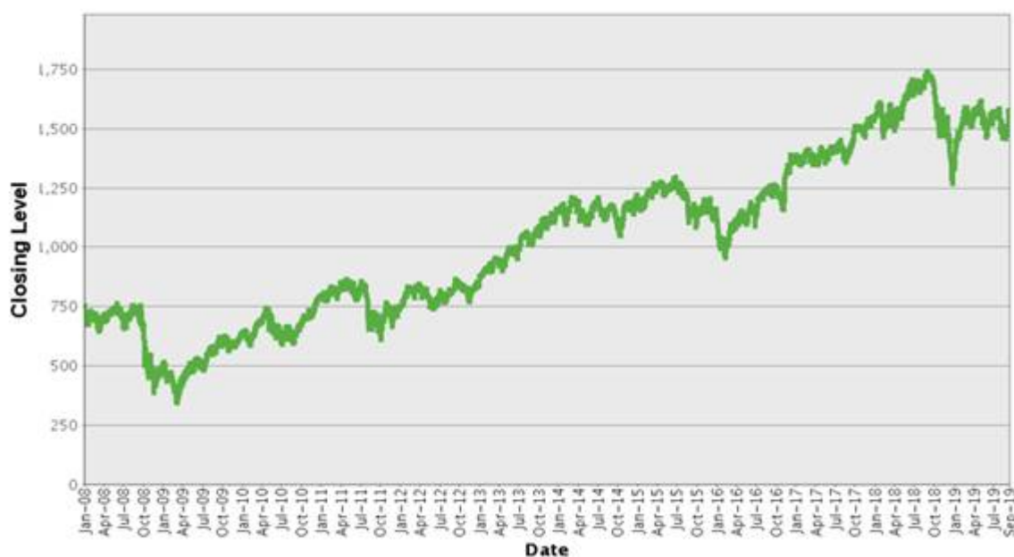
Russell 2000® Index – Historical Closing Levels January 2, 2008 to September 16, 2019

The graph below shows the closing level of the Russell 2000® Index for each day such level was available from January 2, 2008 to September 16, 2019. We obtained the closing levels from Bloomberg L.P., without independent verification. You should not take historical closing levels as an indication of future performance.