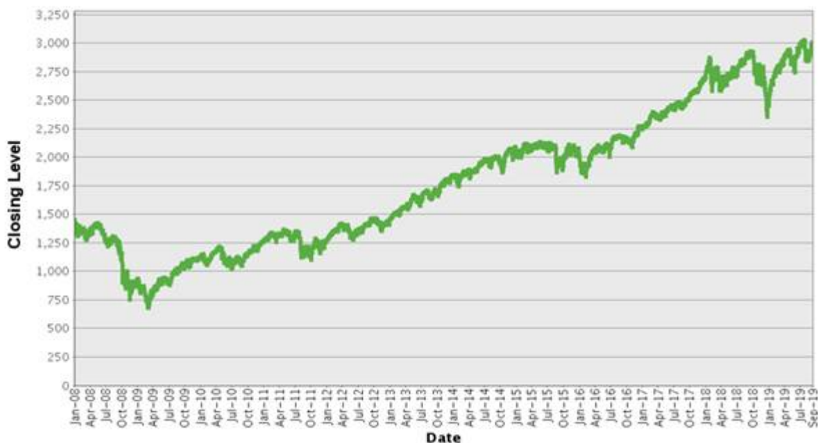
S&P 500 ® Index – Historical Closing Levels January 2, 2008 to September 16, 2019

The graph below shows the closing level of the S&P 500 ® Index for each day such level was available from January 2, 2008 to September 16, 2019. We obtained the closing levels from Bloomberg L.P., without independent verification. You should not take historical closing levels as an indication of future performance.