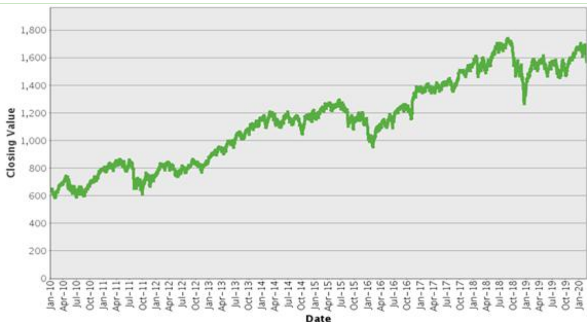
Russell 2000® Index – Historical Closing Values January 4, 2010 to February 25, 2020

The graph below shows the closing value of the Russell 2000® Index for each day such value was available from January 4, 2010 to February 25, 2020. We obtained the closing values from Bloomberg L.P., without independent verification. You should not take historical closing values as an indication of future performance.