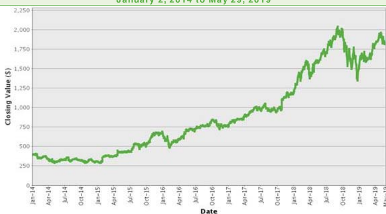
Amazon.com, Inc. – Historical Closing Values January 2, 2014 to May 29, 2019

The graph below shows the closing value of Amazon.com, Inc. for each day such value was available from January 2, 2014 to May 29, 2019. We obtained the closing values from Bloomberg L.P., without independent verification. If certain corporate transactions occurred during the historical period shown below, including, but not limited to, spin-offs or mergers, then the closing values shown below for the period prior to the occurrence of any such transaction have been adjusted by Bloomberg L.P. as if any such transaction had occurred prior to the first day in the period shown below. You should not take historical closing values as an indication of future performance.