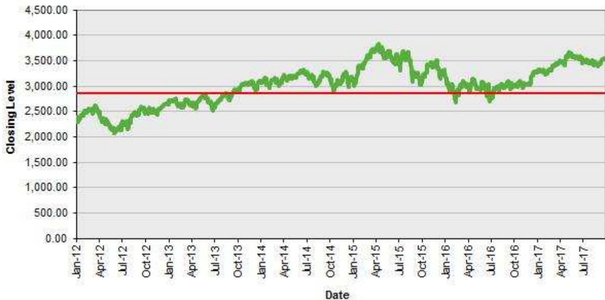
EURO STOXX 50® Index – Historical Closing Levels January 2, 2012 to September 26, 2017

* The red line indicates the barrier level of 2,829.104, equal to 80.00% of the closing level on September 26, 2017.