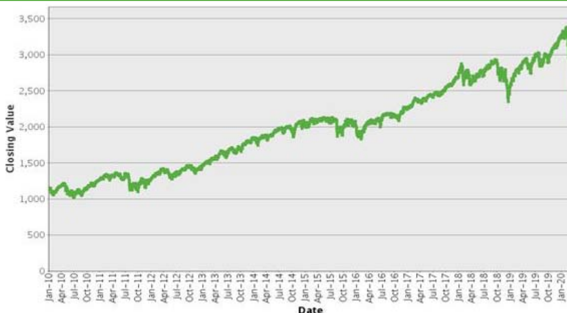
S&P 500 ® Index – Historical Closing Values January 4, 2010 to March 25, 2020

The graph below shows the closing value of the S&P 500 ® Index for each day such value was available from January 4, 2010 to March 25, 2020. We obtained the closing values from Bloomberg L.P., without independent verification. You should not take historical closing values as an indication of future performance.