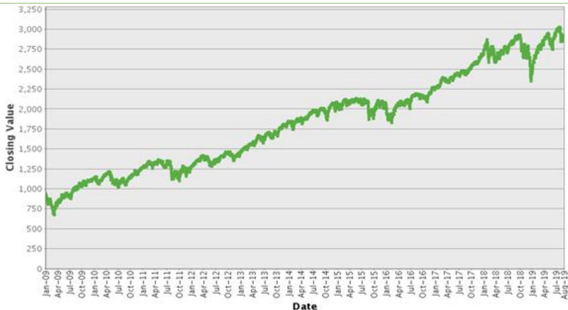
S&P 500 ® Index – Historical Closing Values January 2, 2009 to August 27, 2019

The graph below shows the closing value of the S&P 500 ® Index for each day such value was available from January 2, 2009 to August 27, 2019. We obtained the closing values from Bloomberg L.P., without independent verification. You should not take historical closing values as an indication of future performance.