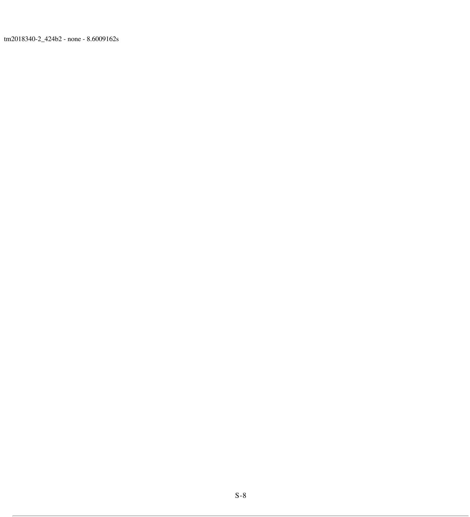
TABLE OF CONTENTS?